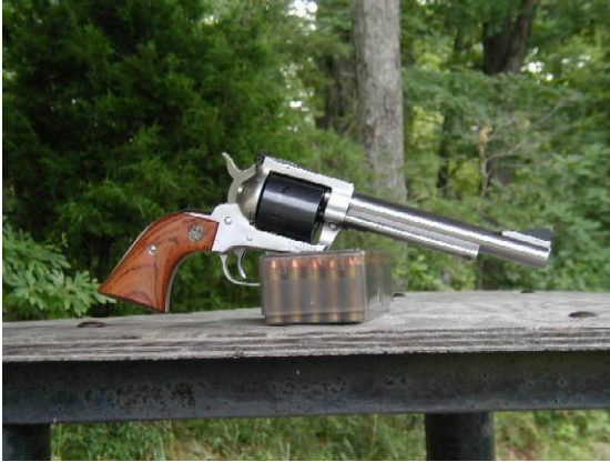
.357 Bain & Davis on a stainless Blackhawk