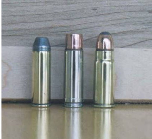
L to R: .454 Casull, .458 Devastator, .450 Bonecrusher