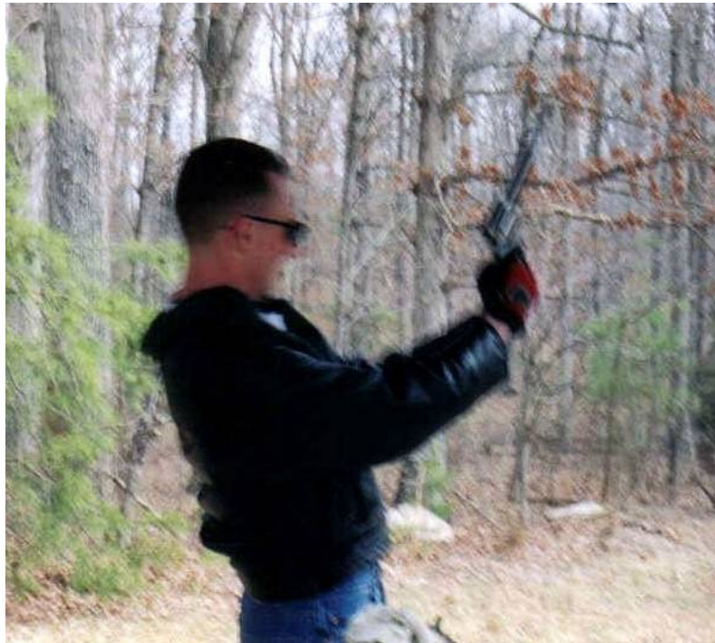
Me after.....recoil is stiff but manageable