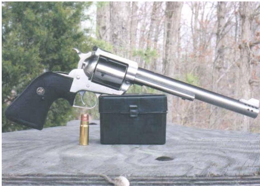
.450 Bonecrusher Conversion